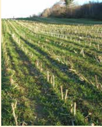
A cover crop grows in no-till corn residue on a Maine farm.