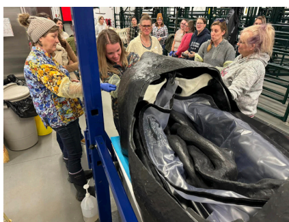
Participants of the Ladies Calving Clinic in partnership with Northwestern Polytechnic

On January 19, 2024 our hard-working Extension Team hosted the first Northern Women in Agriculture Conference at the Dunvegan Inn & Suites in Fairview, Alberta - and what a remarkable and empowering day it was!